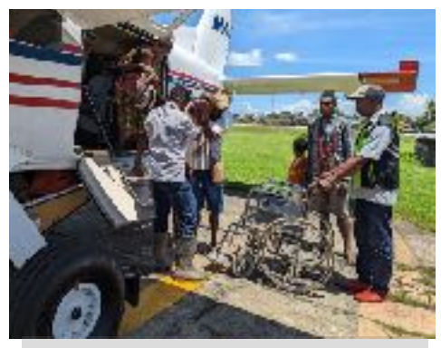
Lots of people seeking medical help from interior. Sometimes we even bring those who are dying back into their village so they can be buried next to their family.