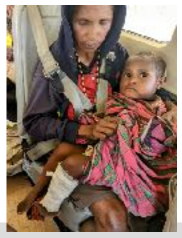
Not sure what this little lady's name is, but she is cared about deeply by God. Broke her leg playing in the garden.